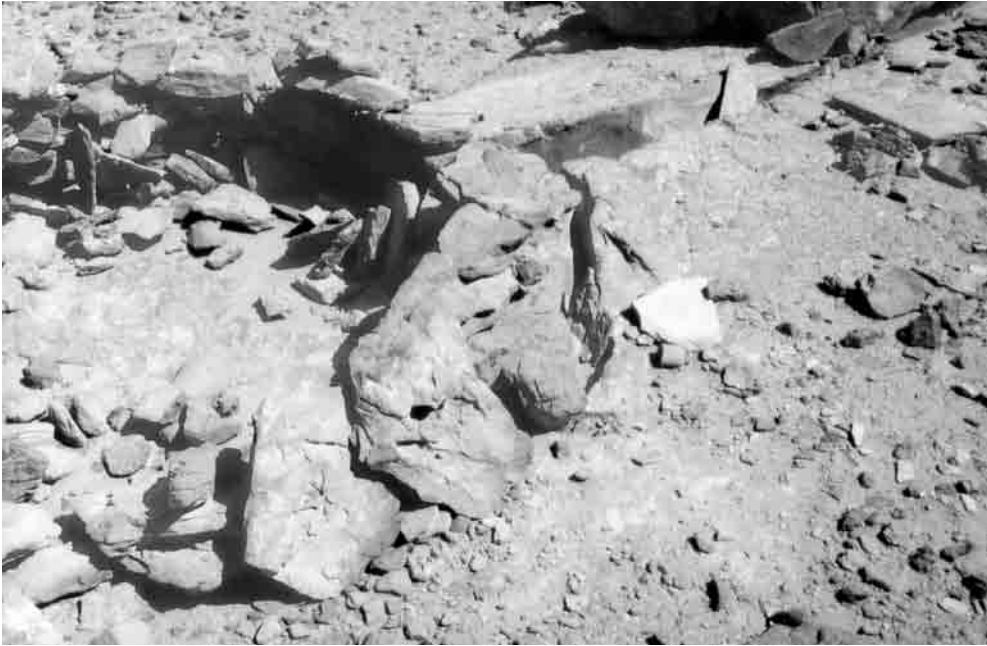
Fig. 2. Circular stone arrangement.