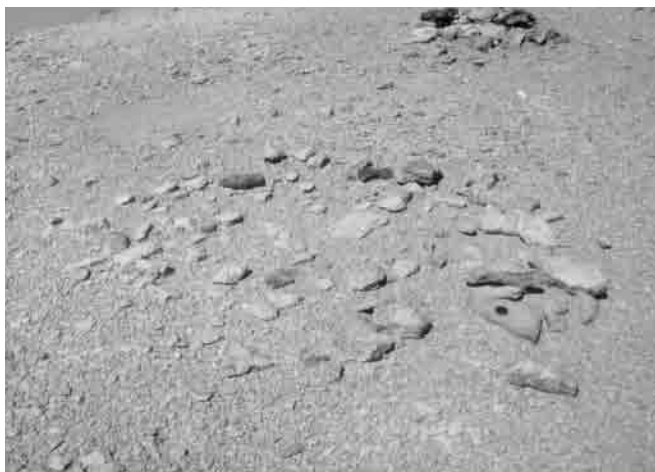
Fig. 8. Stone circles.

some petroglyphs only, and some have a combination of both. Fig. 8 is an example with two stone circles.