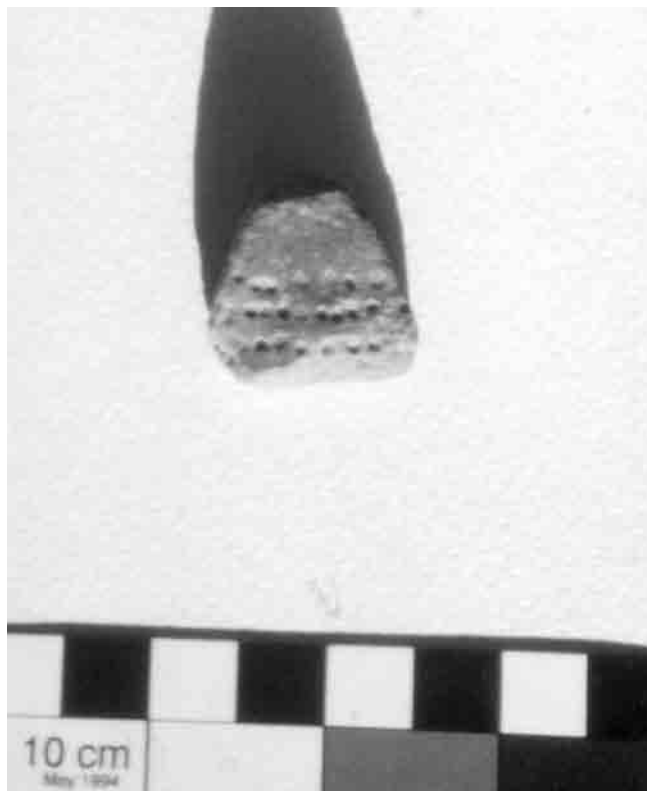
Fig. 9. Sherd with decoration.

On the floor of the wadis in Gilf Kebir occasionally isolated ceramic sherds can be found. Three of them were thermoluminescence dated. This method is known for its low accuracy. Two pieces were dated 3000 \pm 400 years and 5000 \pm 750 years, respectively (Labor Kotalla, n°. 0133020 and 0233020, Basis 2001). This confirms their Neolithic age. A third sherd, Fig. 9, possibly from the decorated rim of a vessel, is surprisingly young with 1500 \pm 300 years (n°0333020).