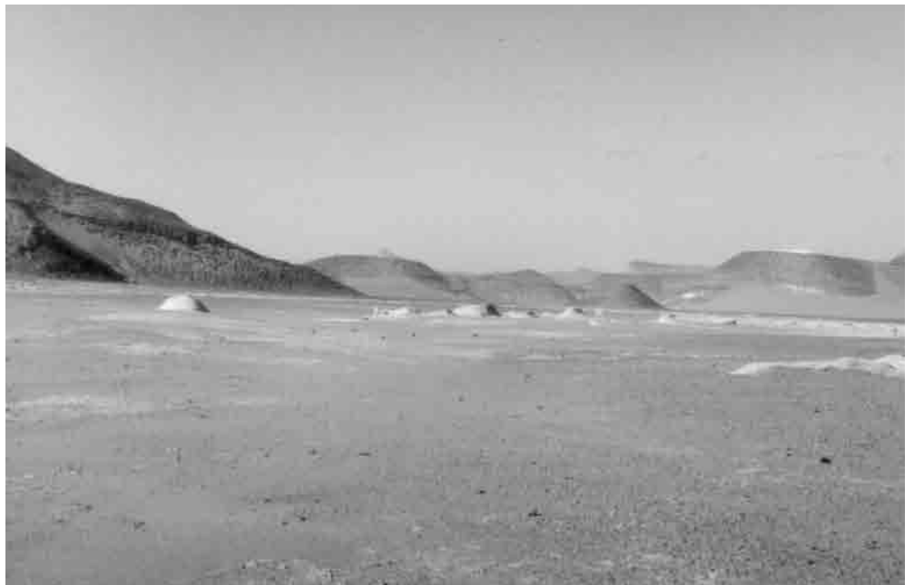
Fig. 7. Rock with grinding hollows.