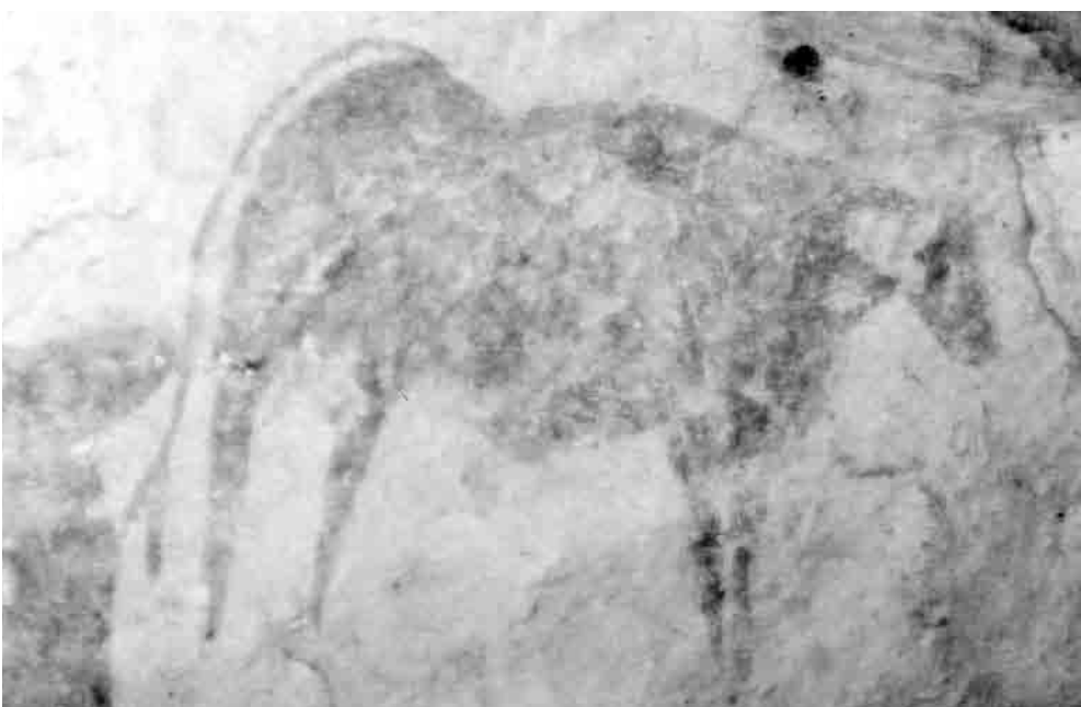
Fig. 4. Pictogram of cow, udder in twisted perspective, damaged by pecking.