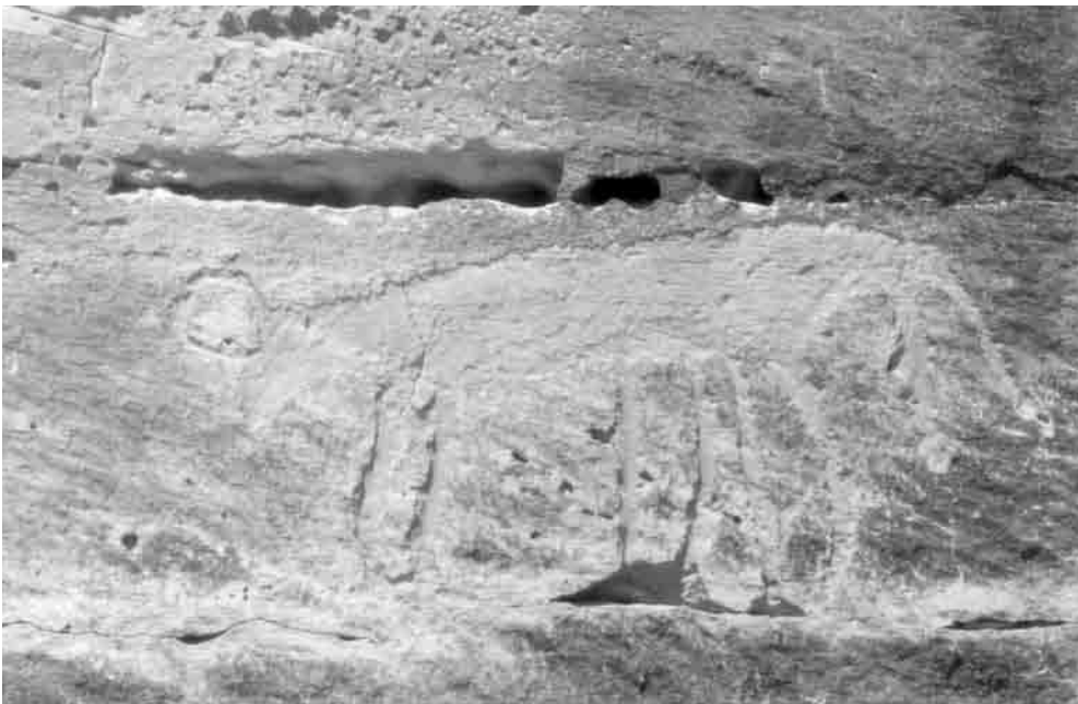
Fig. 3. Petroglyph of bovid ?